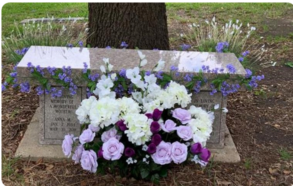
Happy Mother's Day 2021