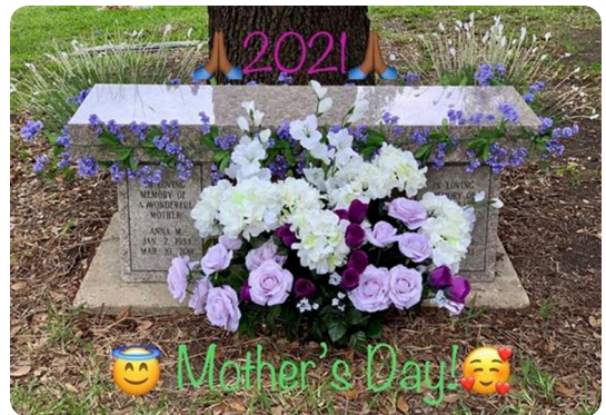
Happy Mother's Day 2021